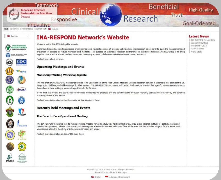
THE INA-RESPOND NETWORK'S WEBSITE: WWW.INA-RESPOND.NET

Worried that you might not know or understand the content of the website? The INA-RESPOND website is available in English and Indonesian, so you can relax and kiss your worry away. ☺