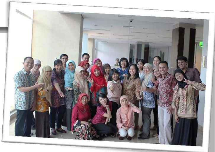
Picture 2 Lab Training, Bogor, October 2014.