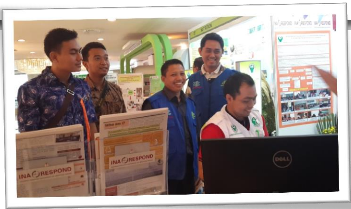
Picture 5 Visitors lining up at the quiz post to check their knowledge, try out their luck, and win a prize.